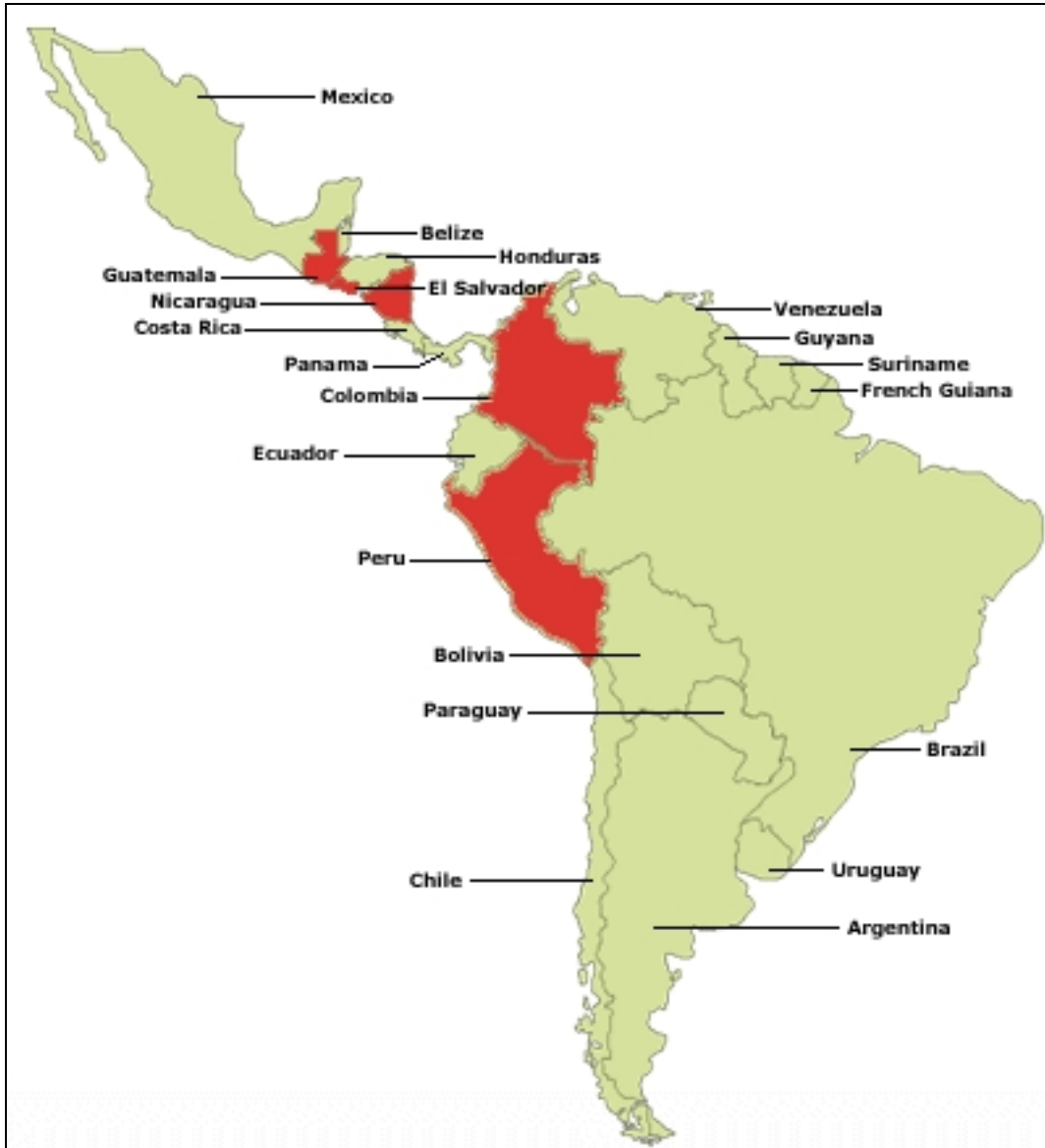
Figure 1 Bad Neighborhoods in Latin America (1971-2000)

Source: www.ftaconsulting.com/images/map.gif *Bad neighborhoods in red (modification)