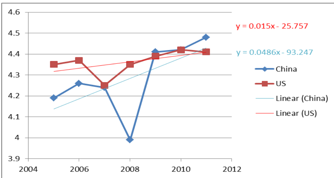
Figure 2 Trend of overall satisfaction for US and China from 2005 to 2011

The average value of satisfaction versus time for China and the United States is shown on the following chart (Figure 2). The trend equations each have an r-square about 0.3. The trend for China is about 3 times greater than the United States.