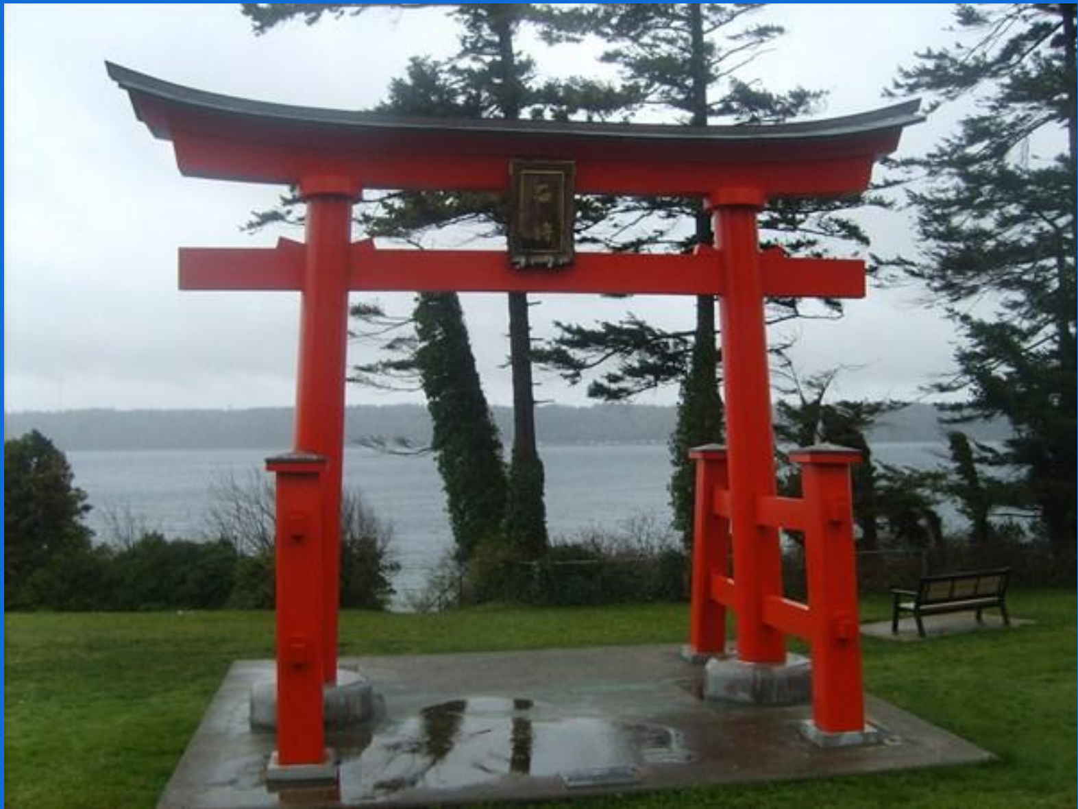
Torii Gate by Campbell River, 1993. Wood, metal, cement. By the Campbell River at Sequoia Park British Columbia, Canada.