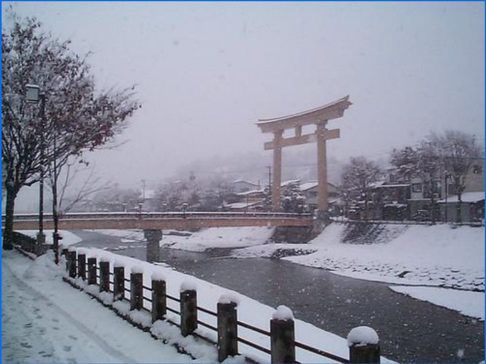
Torii Gate by Miyagawa River. Wood, metal, cement. by the Miyagawa River, Takayama, Japan.