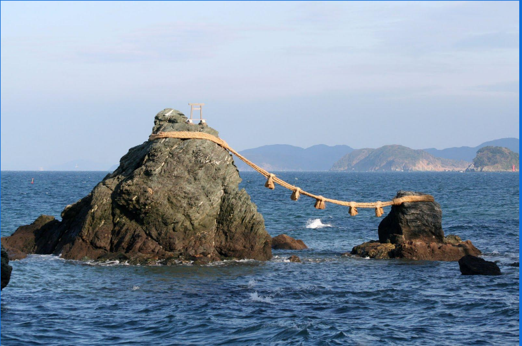
Meoto Iwa , 1910. Stone, cord, wood, concrete, 3.6 x 9 meters. Futami Okitama Jinja, off the shore of Futami, Mie, Japan.