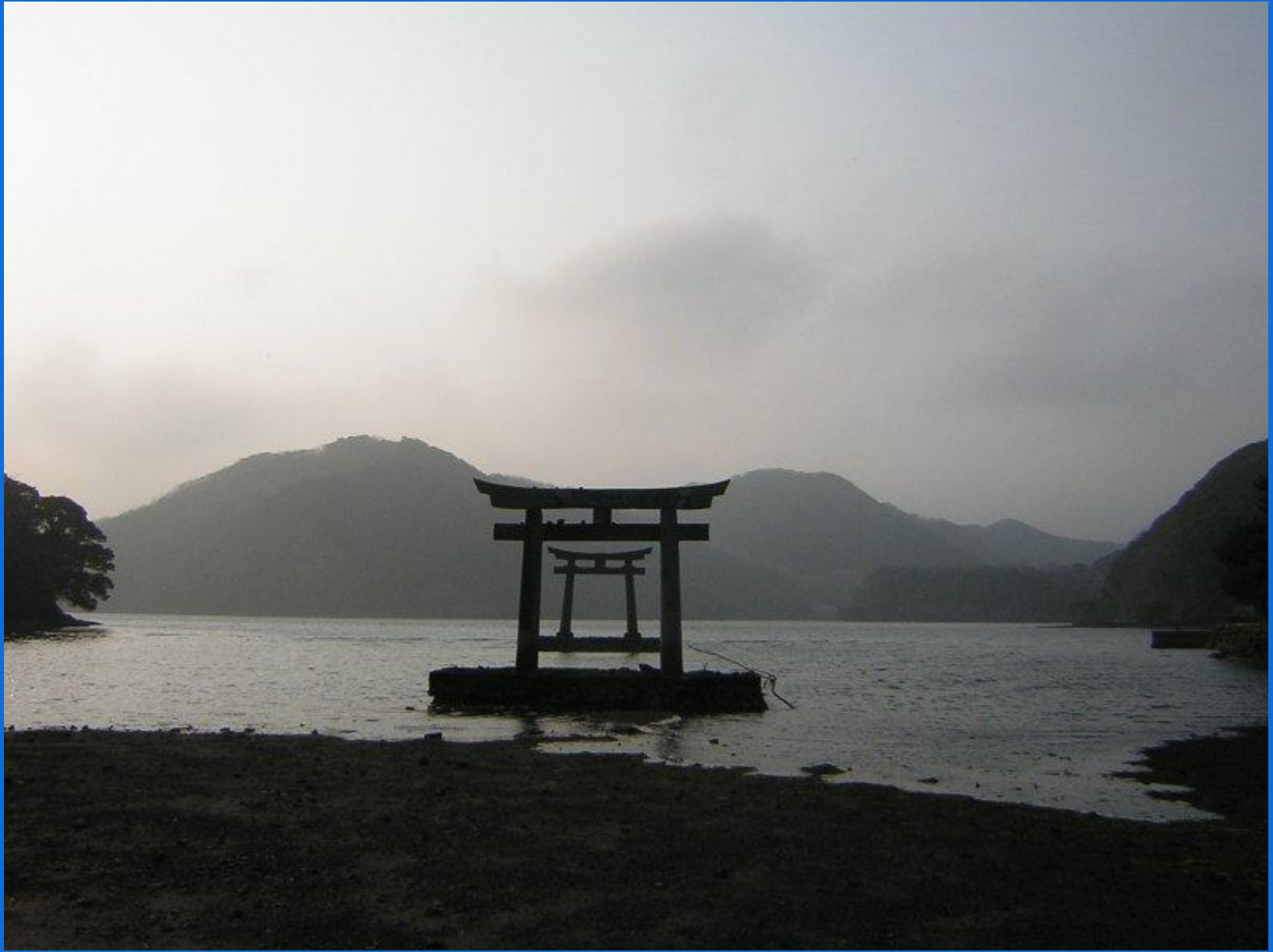
Torii Gate at Watazumi Shrine, 1950. Wood, cement. Watazumi Shrine, Tsushima Island.