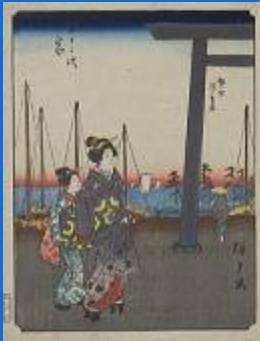
Utagawa Hiroshige, Jinbutsu Tokaido & Takaido Harimaze-zue , 1760. Woodblock print, Bank of Tokyo-Mitsubishi, Akatsuka, Japan