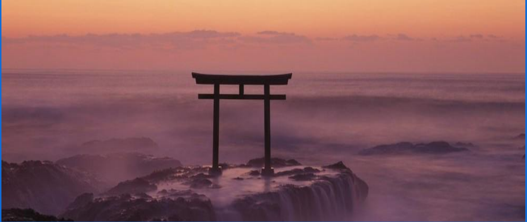
Torii Gate at Oarai Ibaraki, 1000 CE. Stone, cement. Oarai Ibaraki Shrine, off the shore of Oarai Ibaraki.