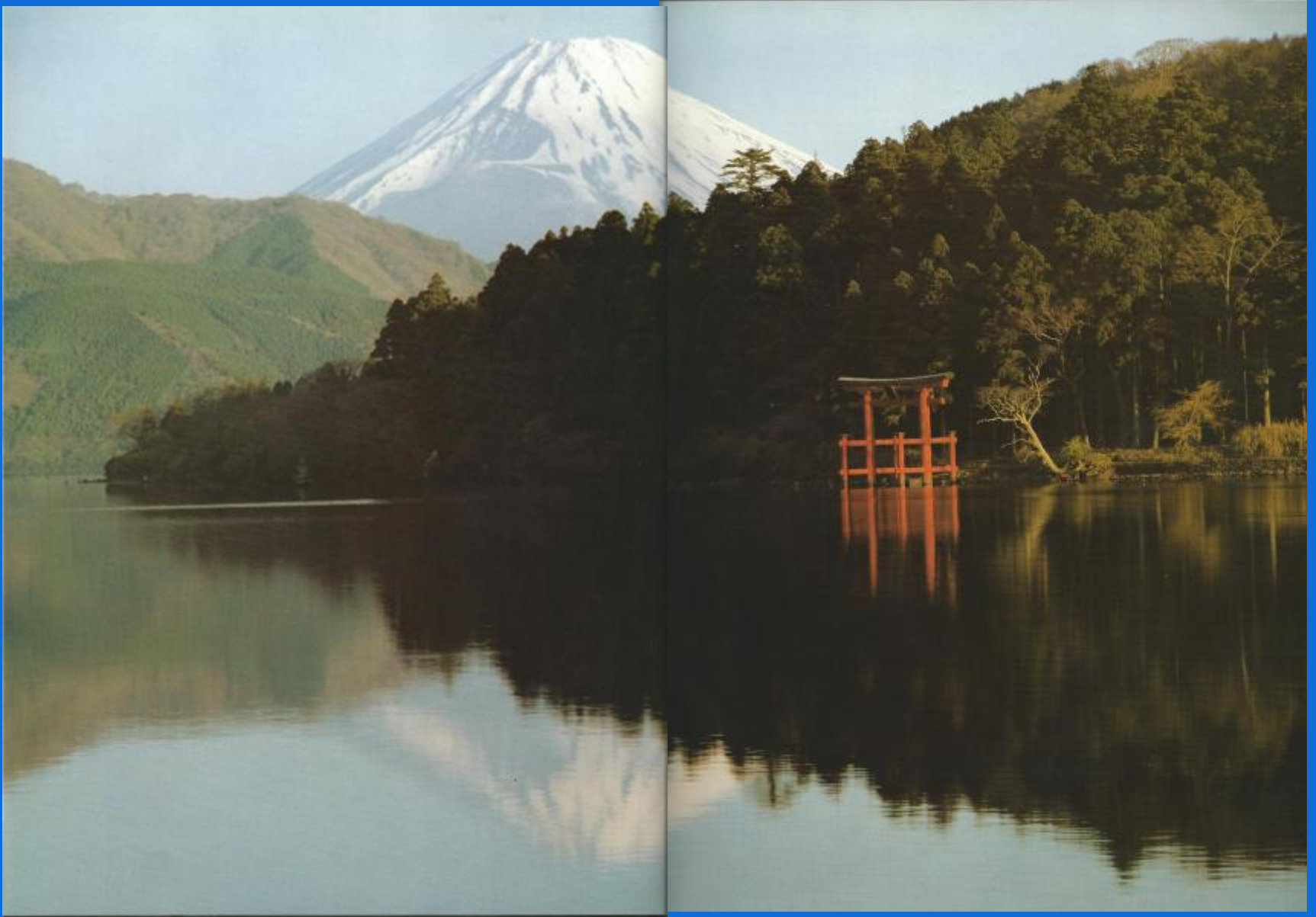
1. Kaneko Keizō, Torii at Mt. Fuji , 1980. Print color photograph, 10 x 18 inches. Lake Fuji, Japan.