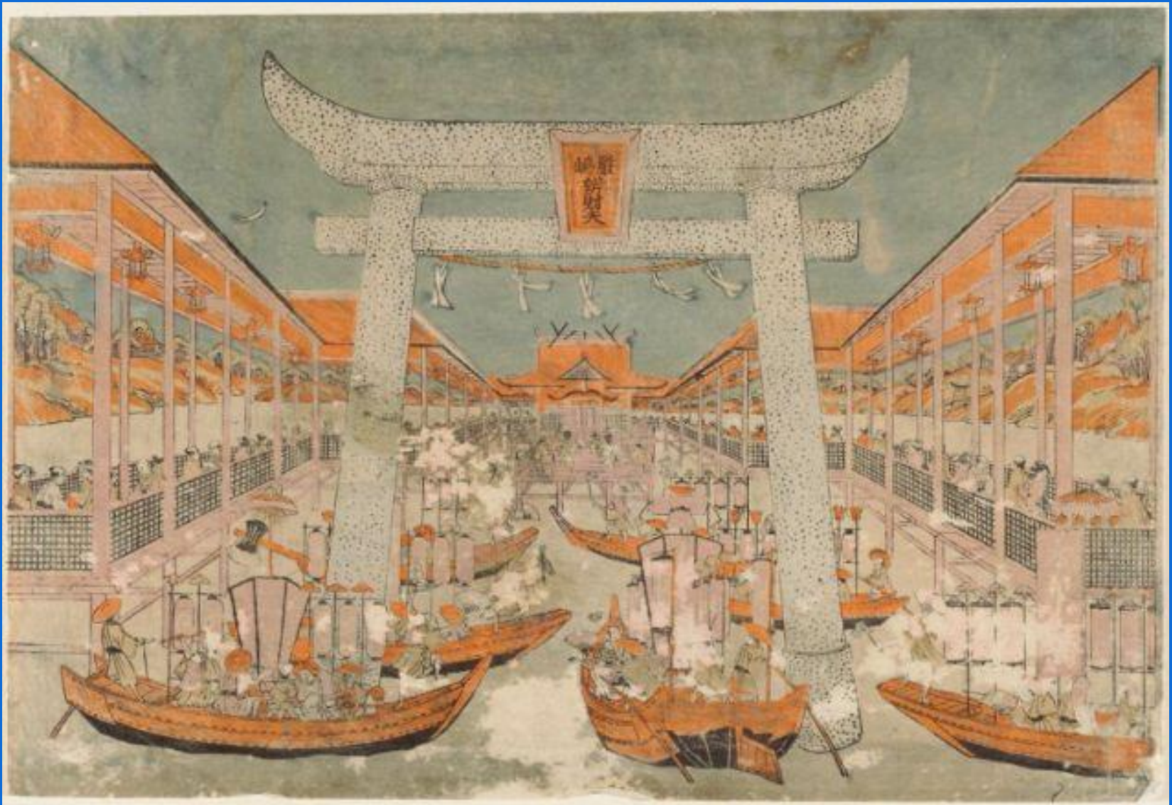
Utagawa Toyoharu, Itsukushima Shrine , 1760. Woodblock Print, 25.4 x 37 cm. Museum of Fine Arts, Boston.