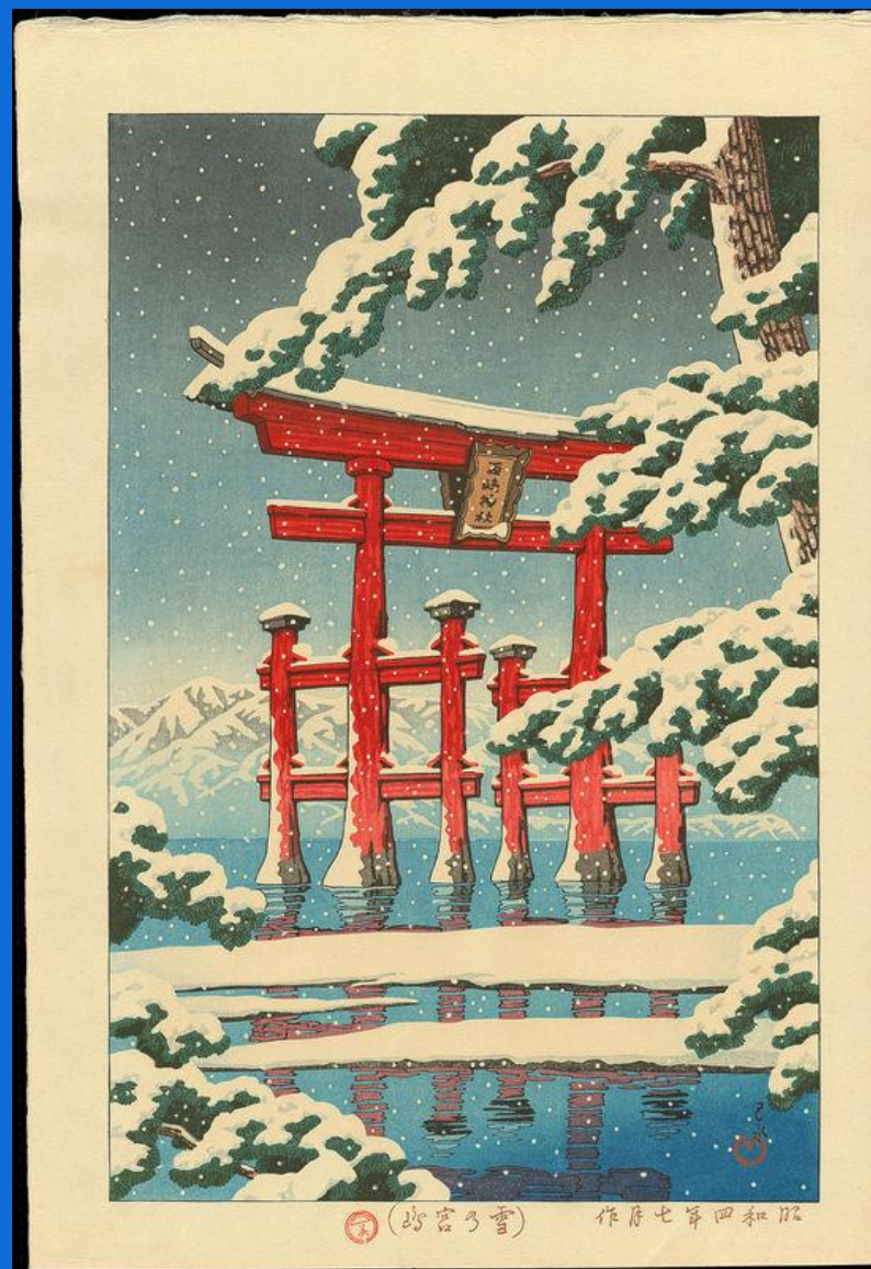
Kasawe Hasui, Snow at Miyajima, 1929. Woodblock Print, 9x14 in.