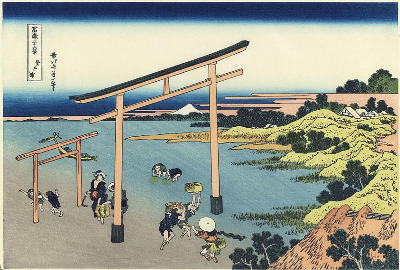
1. Hokusai, Bay of Noboto in Shimosa Province , 1830. Woodblock print, 14 x 9 in. Fuji Arts, Ann Arbor, MI.