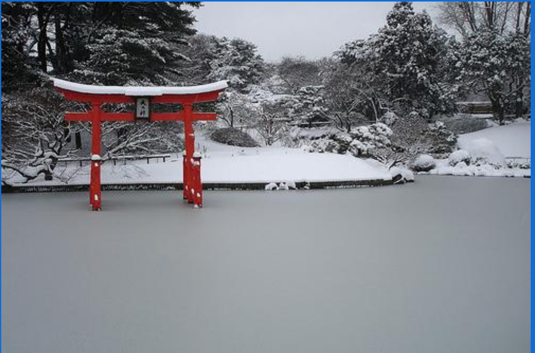
Torii Gate at Brooklyn Botanic Garden, 1915. Wood, bronze. Japanese Hill-and-Pond Garden, Brooklyn Botanic Garden, New York.