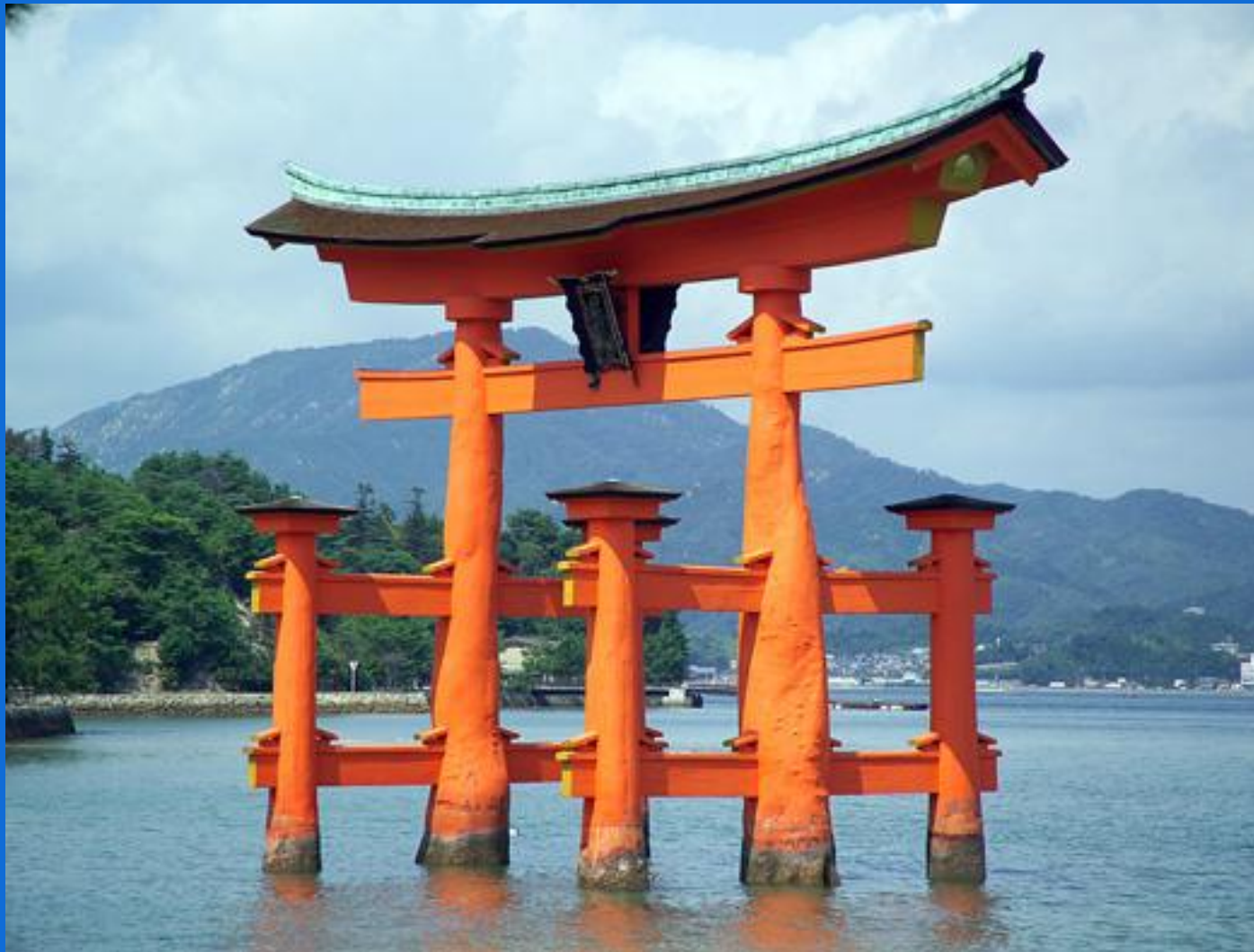
Torii Gate at Itsukushima, 16th Century. Wood, concrete, copper. Itsukushima Shrine in Miyajima, Japan.