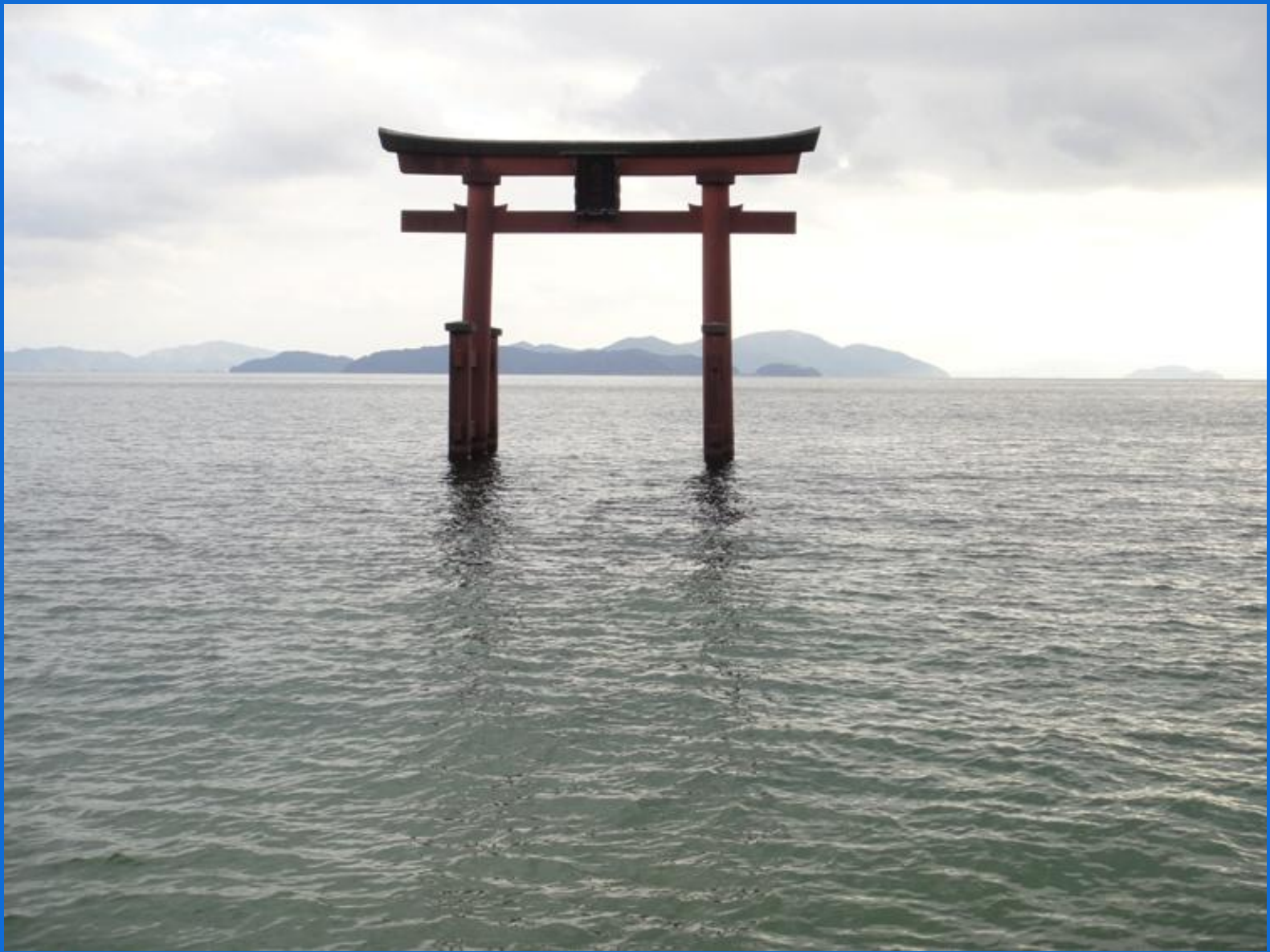
Torii Gate at Shirahige Jinja Shrine, 1937. Wood, bronze, cement, 7.8 x 12 meters. Shirahige Jinja Shrine, Lake Biwa.