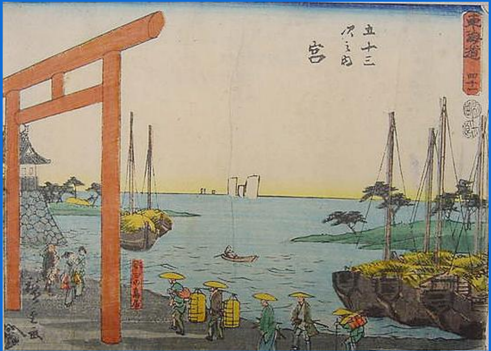
Itagawa Hiroshige, Torii Gate of Atsuta Shrine at Miya Station , 1830. Woodblock print. Kyoto, Japan.