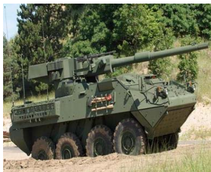
Figure 2. Hypothetical Weapons System A