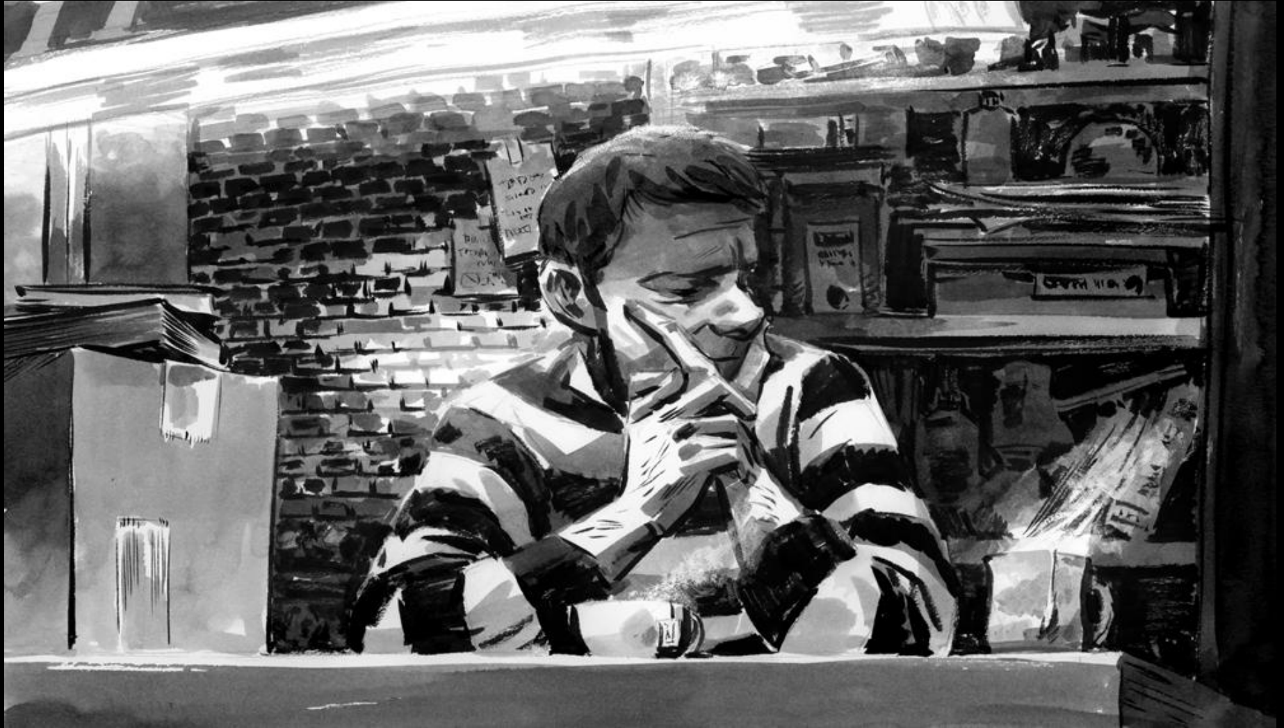
“Old Habits...” ink and white gouache © 2012 Toerning