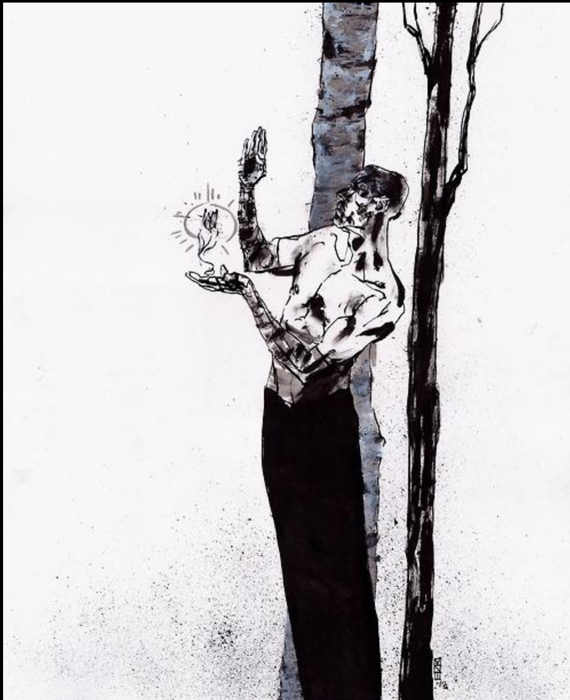
“The Artificer: Spring (3 of 3)” ink and white gouache on bristol © 2013 Vincent Nappi