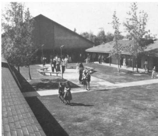
Westside's classrooms and fellowship hall were built in 1973; then the auditorium was added 11 years ago, forming a beautiful mall.