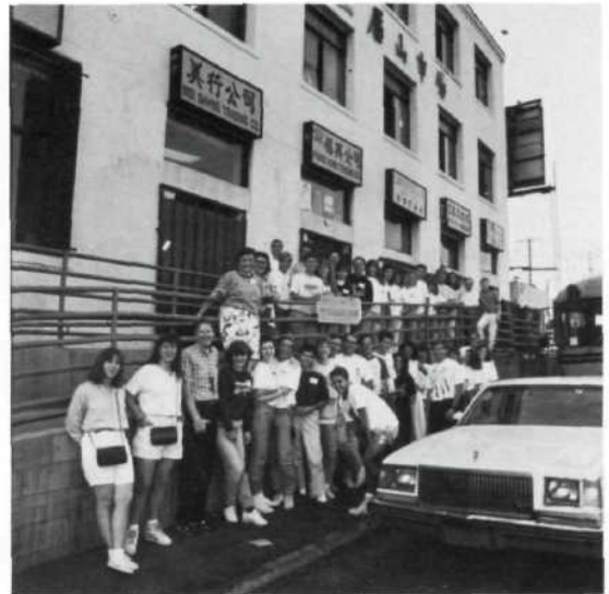
Some of the approximately 500 conference participants took an "urban plunge" to Chinatown in Los Angeles.