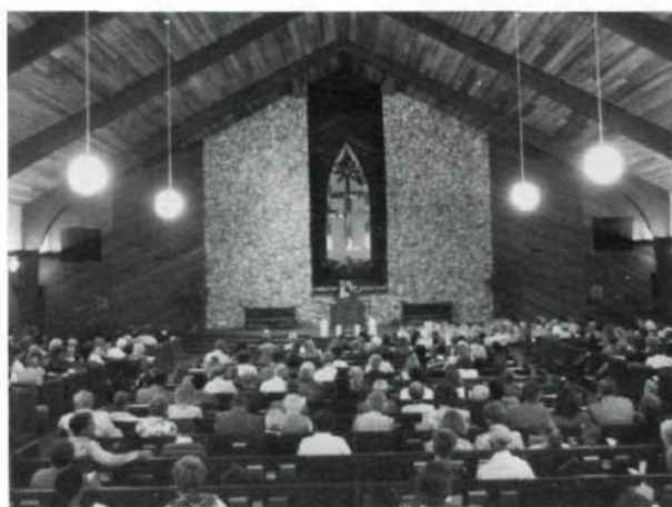
The interior of the auditorium lends a warmth and dignity to worship.

classrooms make it possible to have many small classes. Regular Bible school seminars bring outstanding Christian educators to the church to improve the entire teaching program.