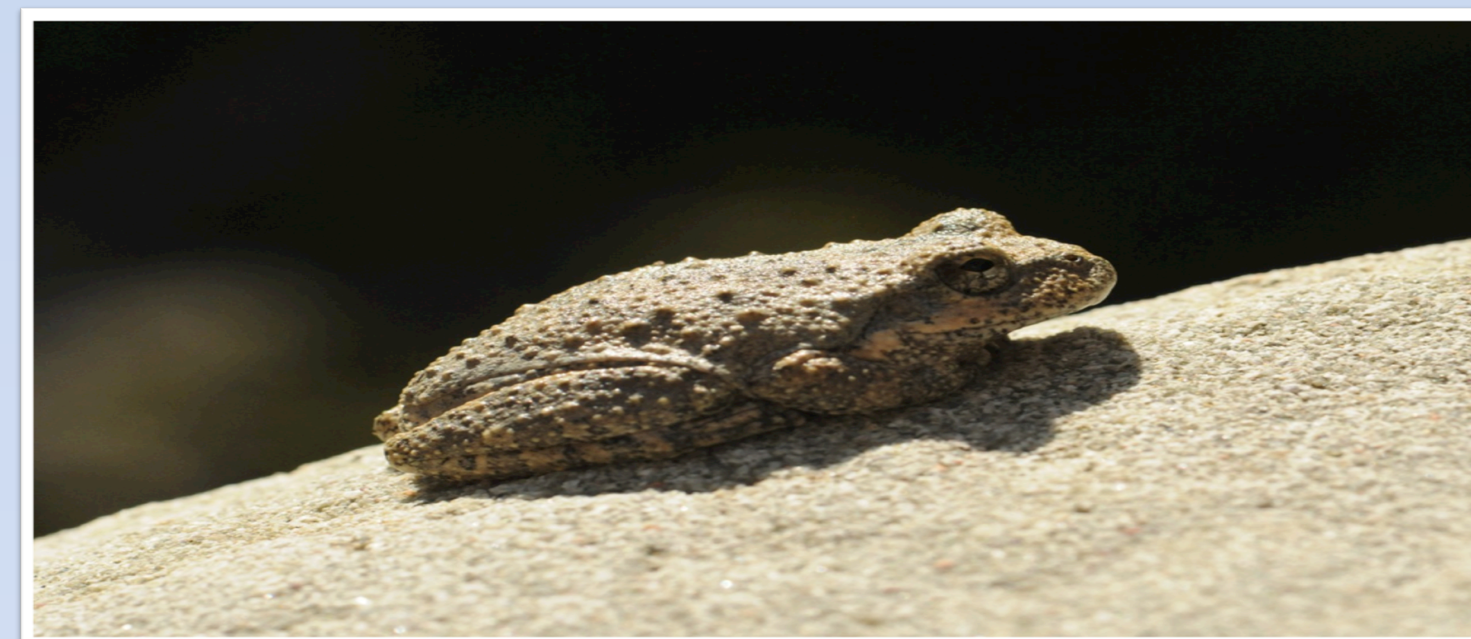
Figure 1. Pseudacris cadaverina

When a frog was located we captured it and placed it on a flat surface. When the frog was stationary, a Streamlight Twintask UV model ® was placed 1 meter directly above the frog, (we constructed an apparatus to maintain relatively constant ambient UV during experimentation.). The flashlight was lowered at a constant vertical velocity until the frog jumped. The distance between the end of the flashlight and the frogs starting position was then measured. This procedure was repeated with each frog, randomizing the order of exposure to visible light, UV-B radiation (.11 \mu w/cm 2 at distance of .2 meters), and with the flashlight turned off as a control.