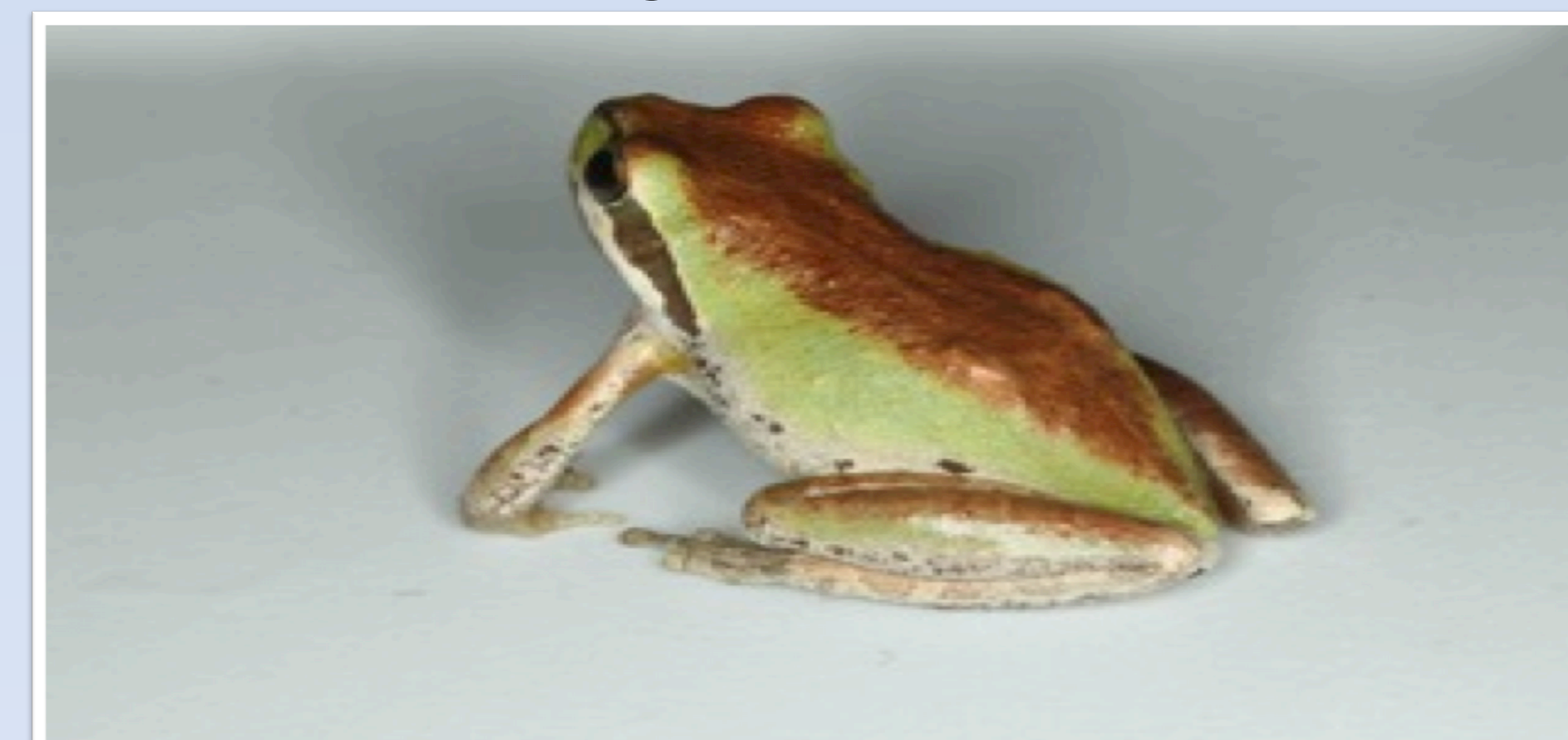
Figure 2. Pseudacris hypochondriaca