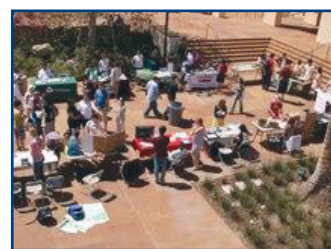
Pepperdine hosts an Annual Earth Day Celebration in April