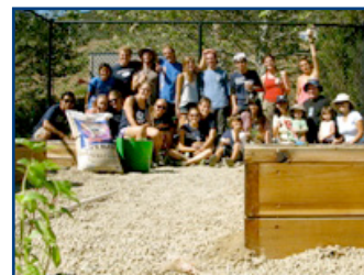
The Green Team leads the Organic Community Garden on campus

The Green Team is a group of dedicated members of the Pepperdine Community—students, faculty, and staff—working to better our world by educating campus and community on living a sustainable lifestyle. They partnered with the Center for Sustainability and the community for Pepperdine's annual Earth Day Celebration in April. Some activities included e-waste recycling, a tour of Pepperdine's organic community garden, free food, and multiple educational exhibits including Crown Disposal, Sodexo, Southern California Edison, the Department of Public Works Water Conservation, Tree People, and the Pepperdine Bookstore.