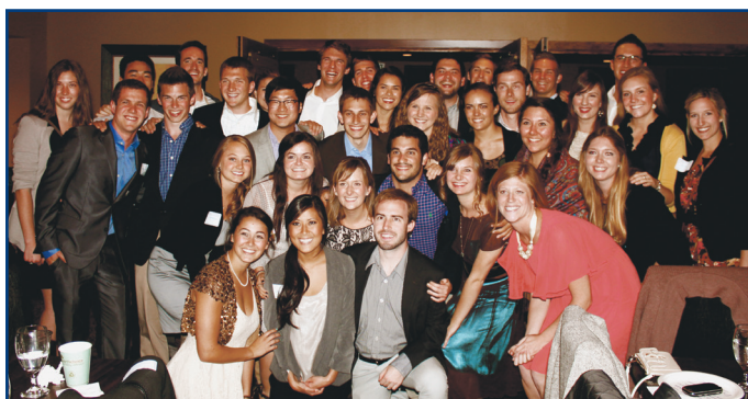
Congratulations to PAC graduating seniors and new members!

Crest Associates and the Crest Board congratulate our graduating Pepperdine Ambassador Council (PAC) students! PAC members celebrated graduating seniors, as well as the incoming members at the annual end-of-year banquet at Malibu and Vine at the Malibu Golf Club. We appreciate our PAC students for their service and outstanding representation as some of the best and brightest of Pepperdine. We wish them an amazing future as they move on to the next phase of their lives, carrying forward Pepperdine's mission of purpose, service, and leadership!