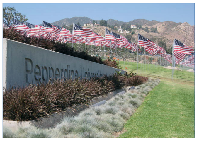
Crest Associates, join Pepperdine as we remember victims and heroes on September 11.

Heroes Garden, located at the Drescher Graduate campus on a bluff overlooking the Malibu campus will be open to visitors all day long.