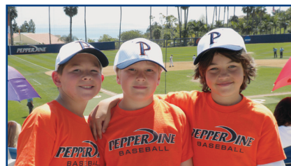
Crest Associates and their families are welcome to attend first Waves Baseball game of the season