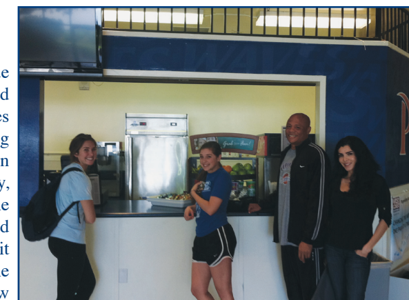
Students, faculty, coaches, and visitors can now enjoy the Firestone Fieldhouse concession stand weekdays!

Dining Services is providing a new venue on campus for healthy options and food service for the athletes, Crest Associates and the Pepperdine community. During this spring semester, the concession stand will be open Monday – Friday, 9 a.m. - 3 p.m. as a pilot program. If the Firestone Fieldhouse concession stand proves to be a successful venue, then it will be considered for continuing in the fall semester. Stop by and let us know what you think—your opinions and suggestions are welcome.