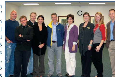
A group of Seaver students network with Pepperdine Alumni entrepreneurs, friends, and staff at SAO Night 2 Network.